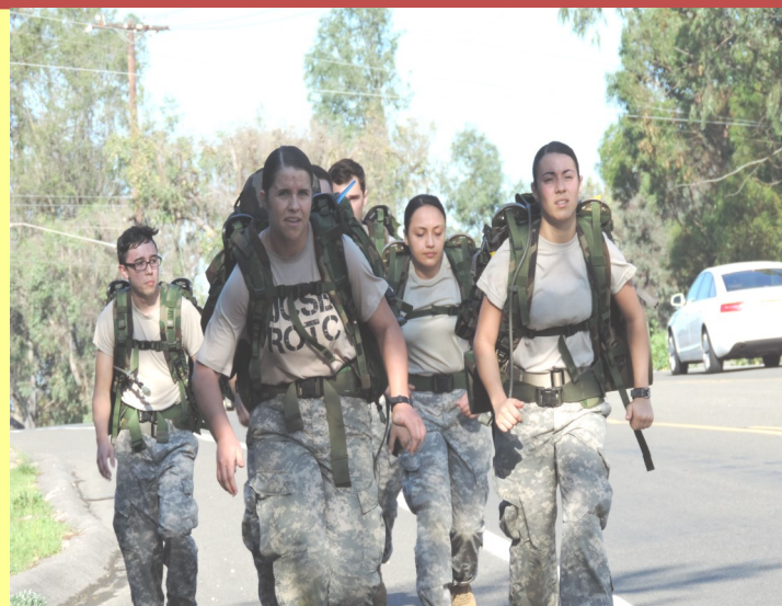
The co-ed military heavy team.

The Bataan peninsula in the Philippines is most known for the tragic event that was responsible for the deaths of US soldiers in World War II. After the US surrendered the peninsula, the Japanese administered a forced march to a prison camp over sixty miles away. The physical toll on the soldiers due to the marching and the brutality of their captors was severe. Deaths of these soldiers impact Americans to this day as they seek to honor and remember those who fell during the Bataan Death March.