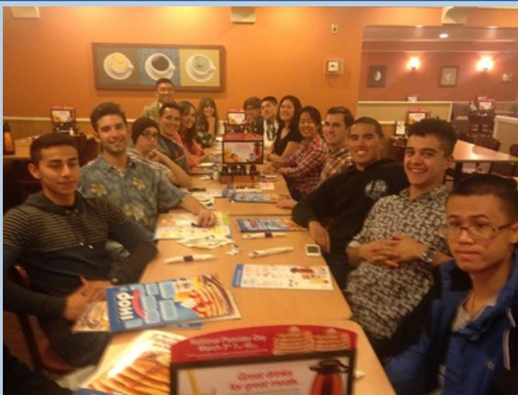
Mentor groups meet up at IHOP for dinner after bowling.

The Mentorship Program has developed significantly since its establishment and has become a vital part of the UCSB ROTC Program. Each MSIV is assigned two to three Cadets from the MSI-MSIII class at the beginning of the school year to provide guidance and support. It also serves to build a personal relationship with those specific underclassmen and to integrate them into the program. Mentors are able to assist MSI Cadets with their transition into college life and aid MSII and MSIII in their preparation for summer training at Fort Knox. Since seniors have ample college and ROTC experience, Cadets turn to them for anything from course suggestions to rides to the train station or help assembling a ruck sack properly. The Mentorship Program also provides MSIVs an opportunity for development as leaders. The minimum requirement of each mentor is bi-quarterly counseling sessions, but the mentors have really gone above and beyond. This year, mentors have done everything from helping their mentees improve their PT scores by doing extra workouts with them, to planning fun events like mentorship bowling competitions or mentor group dinners.