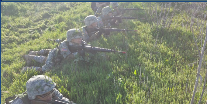
The support element prepares to open fire on their objective at the command of their Patrol Leader.

In reality, life on the Construction Detail is nowhere near as exciting or heroic as the above tale has made it seem, but it is a necessary and great blessing for the Surfrider Battalion. Every weekday from 0730 to 1600, Surfriders of all classes volunteer their time in hour long shifts directing traffic at the construction site on the southeast corner of campus. It is by no means glamorous and deemed tedious by some, but it earns much needed money for the battalion to fund events, such as the Military Ball in the spring, and sets up future classes with liquid assets to begin the year. Though it might not be what we expected to be doing as Cadets, it builds rapport with the university and adds to the legacy to the Surfrider Battalion.