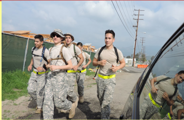
The male light team runs by the trail vehicle without stopping, eager to reach the end of their 14 mile run.