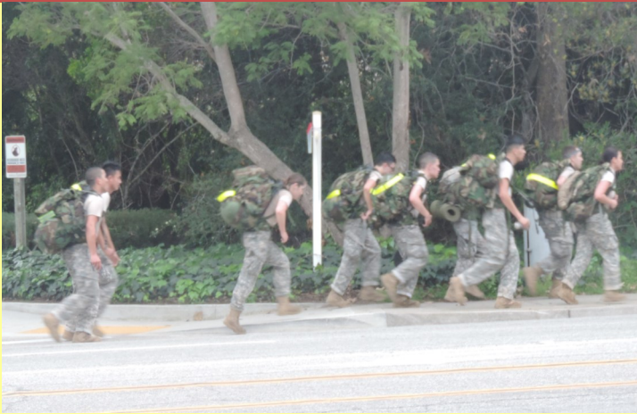
The co-ed and male military heavy teams completing a 14 mile run.